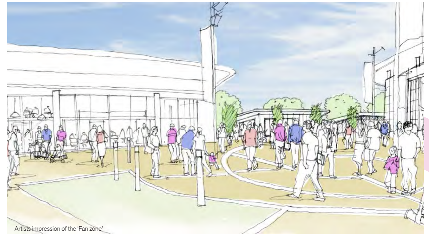
Artists impression of the 'Fan zone'

A catalyst for wider regeneration bringing the power of football and its historic home to achieve greater success and better outcomes for the City and communities of L4.